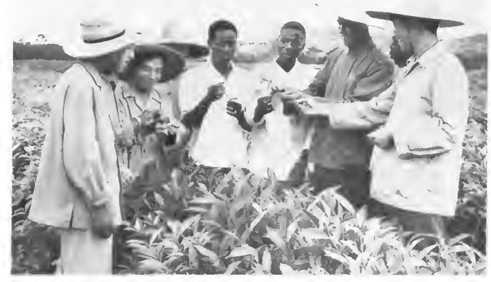
Chinese specialists and Guinean workers study the growth of tea on the Macenta plantation,

After two seasons of experiments, the fine strains of Chinese riee and tobaeco have adapted well to Somali conditions. The experimental station's growing prosperity caused a Somali technician to say proudly, "Our station is the best in all Somalia."